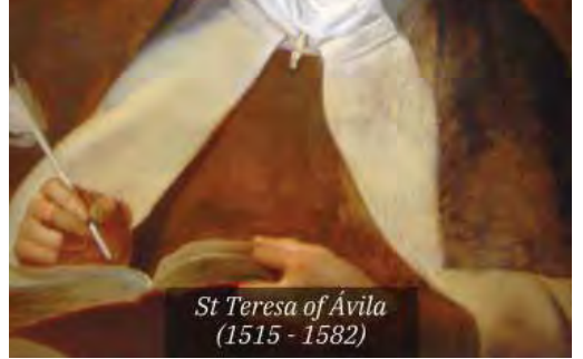
St Teresa of Ávila (1515 - 1582)

It is a dangerous thing to be satisfied with ourselves.